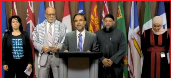
Denied Entry to West Bank, Canadian Delegates Hold Ottawa Press Conference on Illegal Settlements