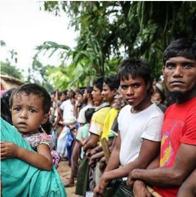
Burma Task Force