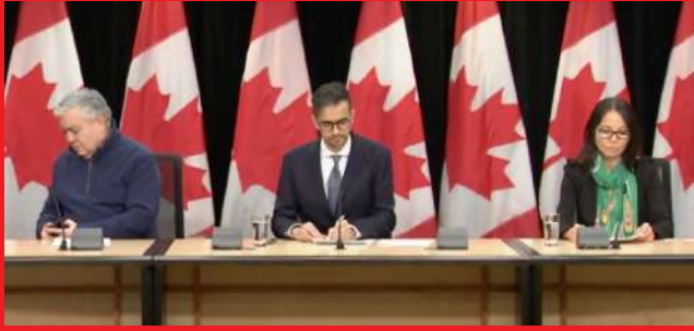
Human Rights Groups & MP Urge Thai Authorities to Halt Deportation of 48 Uyghur Refugees