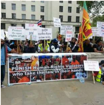
Sri Lanka Task Force