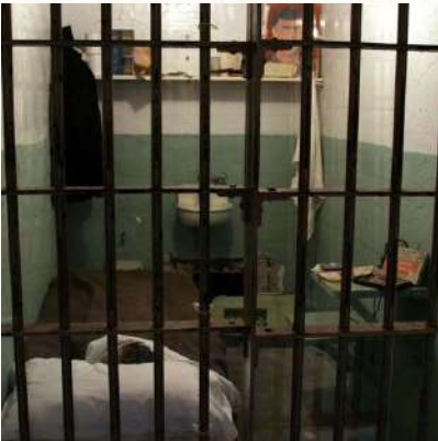
Prisoners of Conscience