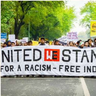
Save India From Fascism